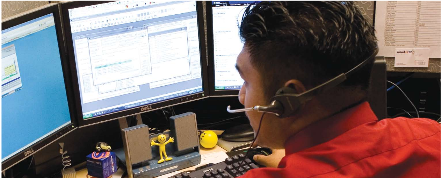
mindSHIFT Customer Care Center